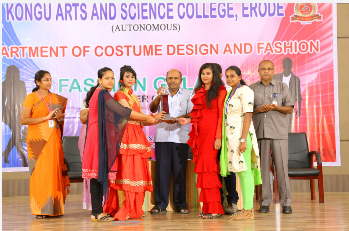
Best Designer Award - PG