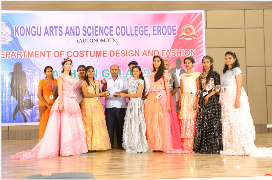
Best Designer Award - UG