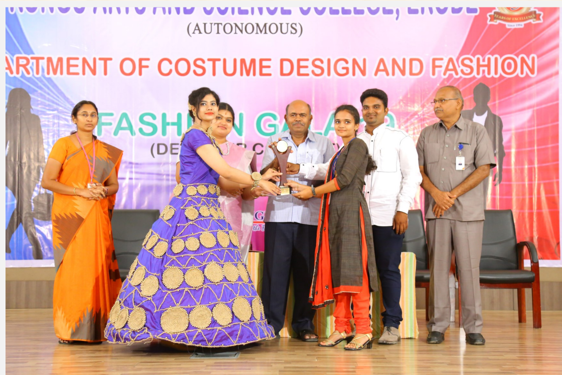
Best Creativity Award - PG