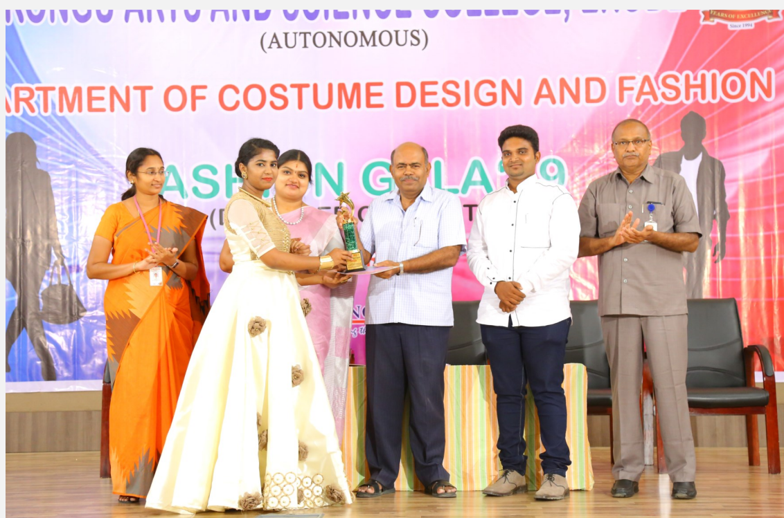
Best Creativity Award - UG